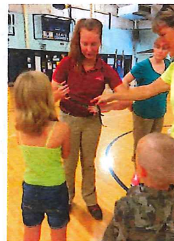
Sunset Zoo Ambassadors