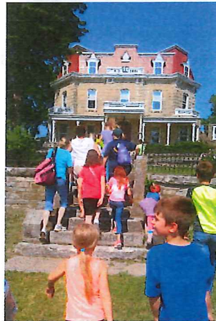
Tallgrass Prairie National Preserve